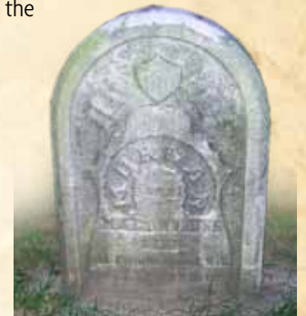
Old Town Graveyard