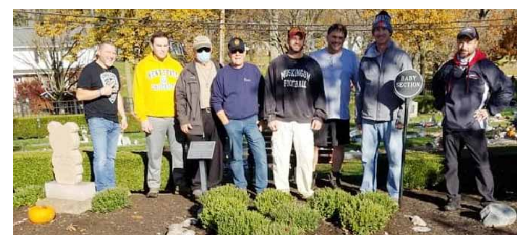
The Oddfellows service group prepared the grounds of the Baby Section for winter on November 7. We are so grateful for their years of service caring for this very special place at Spring Grove!