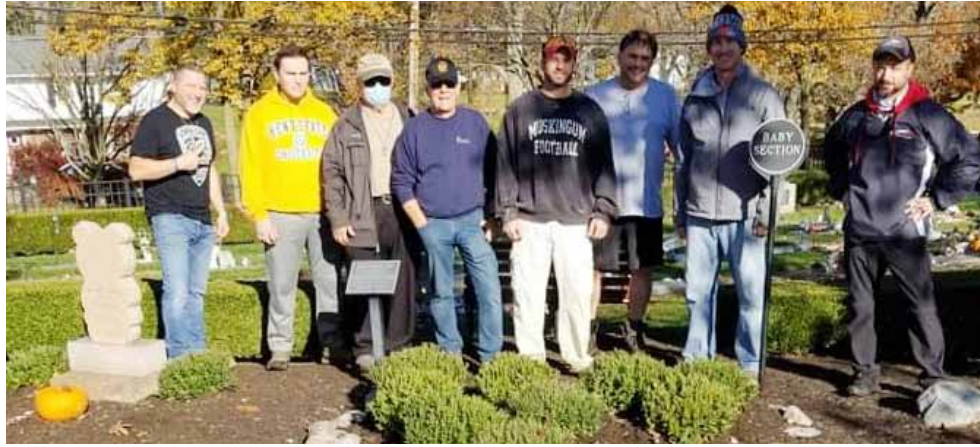
The Oddfellows service group prepared the grounds of the Baby Section for winter on November 7. We are so grateful for their years of service caring for this very special place at Spring Grove!